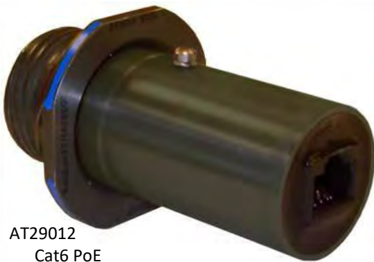
AT29012 Cat6 PoE