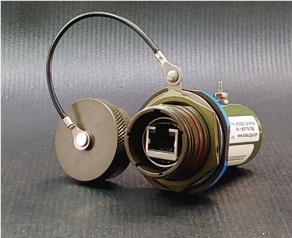
AT29022 - CAT6 PoE+ SHIELDED