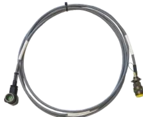
Audio to Mil-Circ