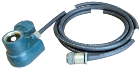
NATO Slave to Mil-Circ

We offer custom, build-to-print military, automotive, medical and commercial cables utilizing state of the art assembly tools, built to IPC and ISO 9001 standards. Our experienced team of technicians and engineers will work closely with you to help design, source, build and test the product that suits your needs. ATS offers high quality cables and harnesses at competitive pricing with typically fast delivery.