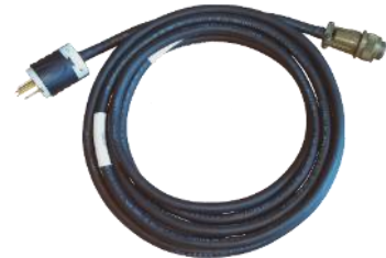
NEMA to Mil-Circ